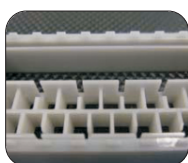
VisiJet® SL Tough