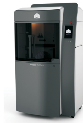
ProJet 7000 HD