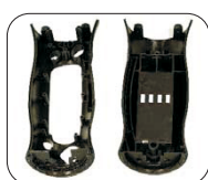
VisiJet® SL Black