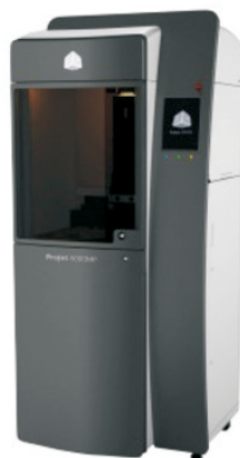
ProJet 6000 HD