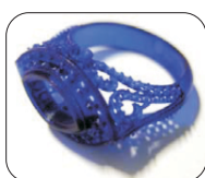
VisiJet® SL Jewel