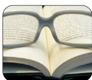
VisiJet® SL Clear